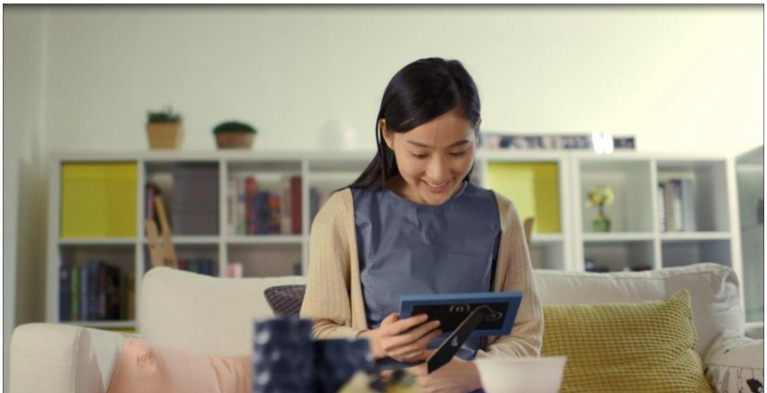
In episode 2 "Touch U", the expectant mother recalled the life with her dead mother and reminded everyone to cherish people nearby.